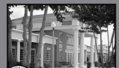
LUCIUS E. AND ELSIE C. BURCH, JR. LIBRARY

301 Poplar View Pkwy. • Collierville 901-457-2600 • colliervillelibrary.org